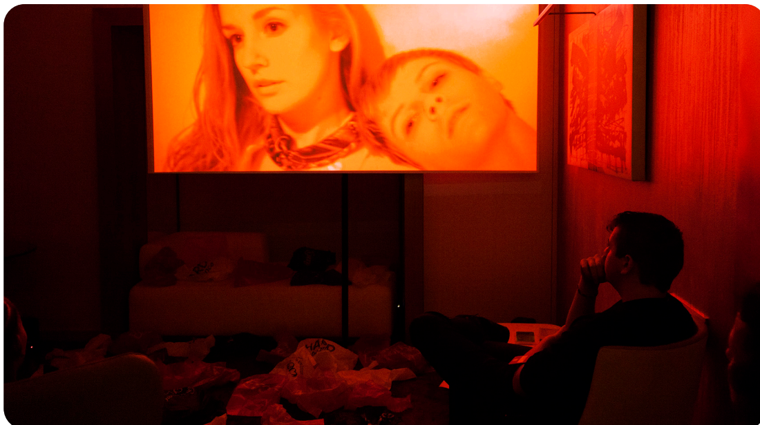
Loop Fair. 2023. Andriess-Eyck. Galerie Rory Pilgrim

Around 40 galleries will participate this year.